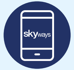
Inflight Magazine on your mobile

For your forms and permits go to www.flyairlink.com