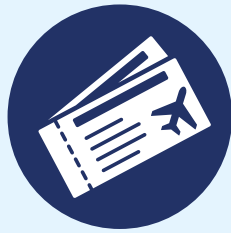
Ticket or Mobile Boarding Pass