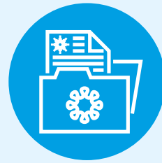
Completed Health Questionnaire