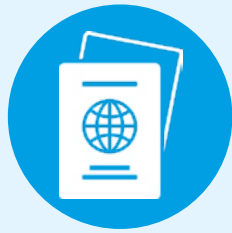
ID/Passport/ Driver's License