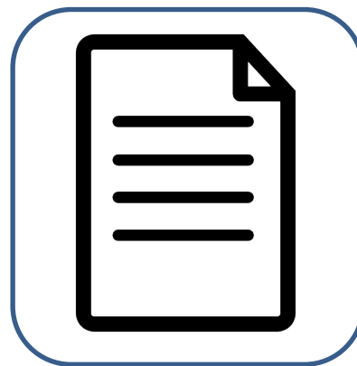
A typed descriptive statement