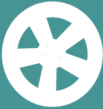
Apps for transportation