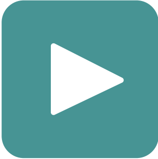
A 3 minute video clip

Please choose one of the following reporting mechanisms describing your solution, how it answers the brief/meets the challenge, user experience with your design, what you learnt through the design experience and what your inspiration was.