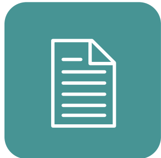
A typed descriptive statement (3 pages max & not larger than 5mb)

To enter the competition, you must submit a completed entry form to Tmigogo@flyairlink.com and visit www.flyairlink.com