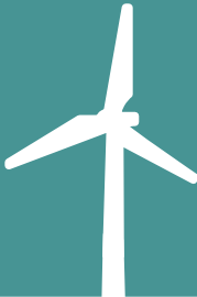
Windmill for energy production Energy preservation