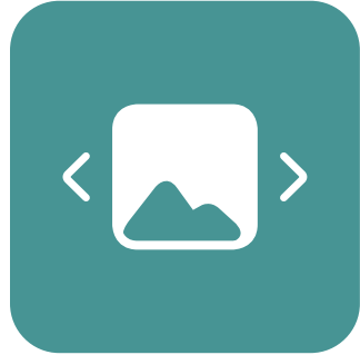
A PowerPoint presentation (10 Slides max & not larger than 5mb)