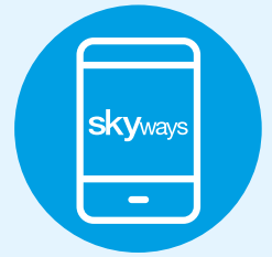
Inflight Magazine on your mobile